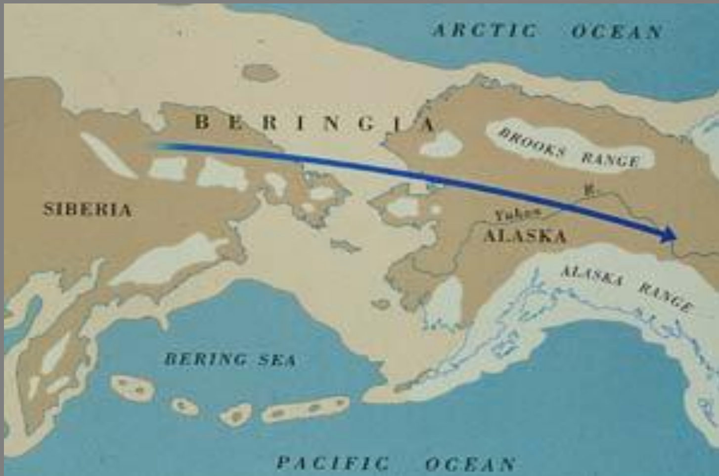
Map: Shows Beringia, the Land Bridge, between Asia and North America.