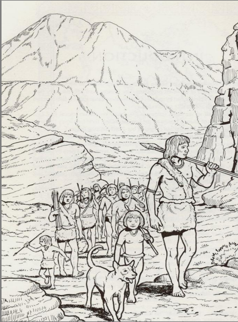
Drawing: The drawing shows a group of nomadic humans crossing over Beringia into the Americas.