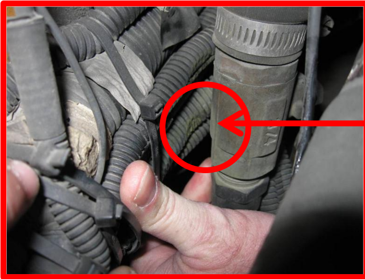
Photo shows convoluted harness protection with minor damage (chafing started on protective wrap). Cable had to be pulled away to view.