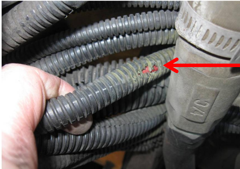
Photo shows convoluted harness protection with medium damage (chafed through protective wrap but NOT into cable covering). Cable had to be pulled away to view.

Photo shows convoluted harness protection with minor damage (chafing started on protective wrap). Cable had to be pulled away to view.