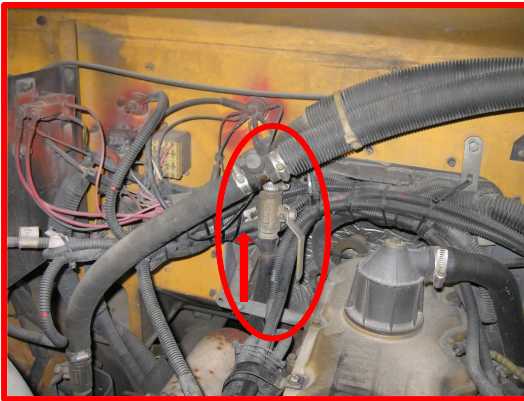
Photo shows ¼ turn heater shutoff valve (circled) that is on a standpipe extending up from back of Caterpillar engine block on the entrance door side of the bus. The grid heater cable is indicated with an arrow. Chafing can occur behind this shutoff valve and may not be visible if the cable is not moved away from the valve piping to visually inspect.